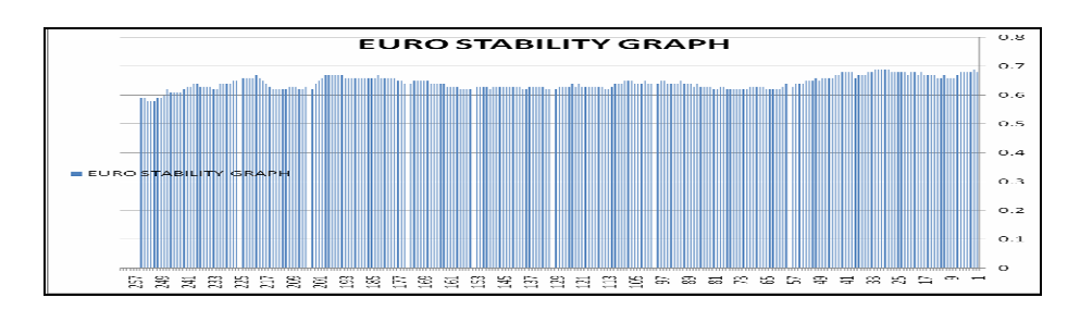
Fig. 3. Euro Stability graph with perspective of Canadian dollar